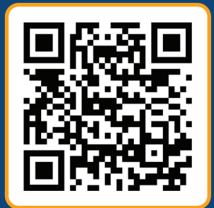
Scan to Visit Website