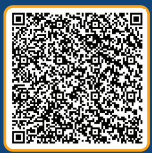
Scan for Location